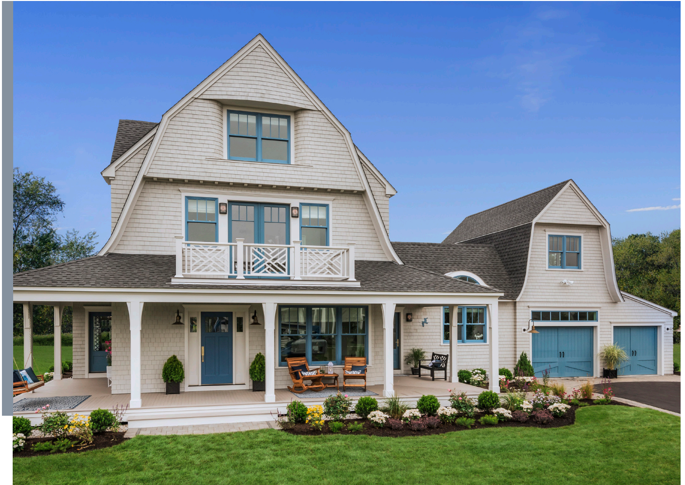
CANYON RIDGE 5-LAYER GARAGE DOOR DESIGN WITH COLOR BLAST.

Looking to achieve a dramatic contrast? Bold colors like vibrant red, lime green or even blue, pink or orange can inject personality and charm into the exterior while still providing the right amount of contrast. Clopay offers custom factory painting with a choice over 1500 Sherwin Williams colors using our Color Blast® Program. The photo above is a custom color that was selected by the builder to match the windows on the home.