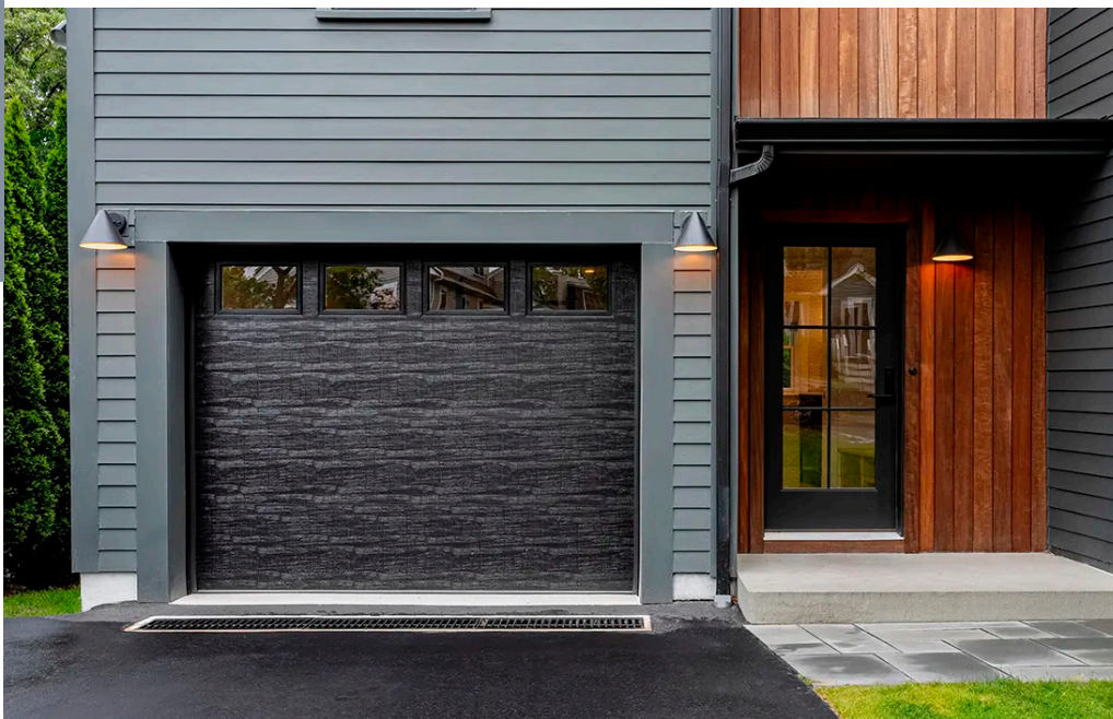
MODERN STEEL FLUSH PANEL GARAGE DOOR IN BLACK WITH WINDOWS.

For a dark exterior, a garage door color that closely matches the secondary hues or accents present in the surrounding landscape or architectural features delivers excellent results. This could include subtle tones like muted greens, soft blues, or earthy browns that blend with the natural elements of the home's exterior.