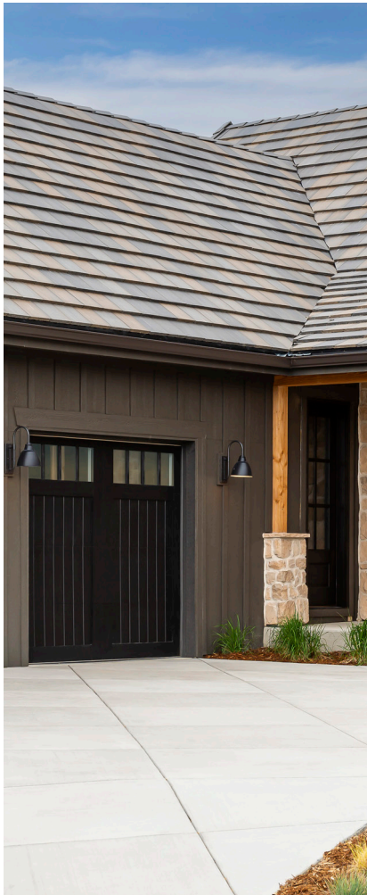
CANYON RIDGE, 5 LAYER, PHOTO CREDIT: ANDY FRAME.

The majority of garage doors being sold today incorporate windows. There are a variety of glass options for privacy, and layouts to fit every type of architecture from traditional to modern.