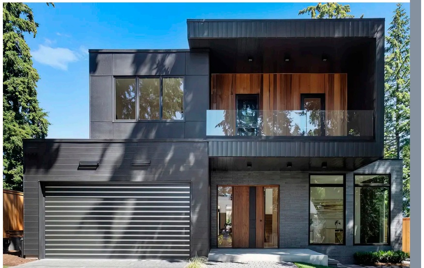
CANYON RIDGE MODERN GARAGE DOOR WITH METAL ACCENT STRIPS IN SLATE FINISH.

Another way to accomplish this effect is to incorporate a garage door that adds pattern or texture into the design instead of relying on color alone. ■