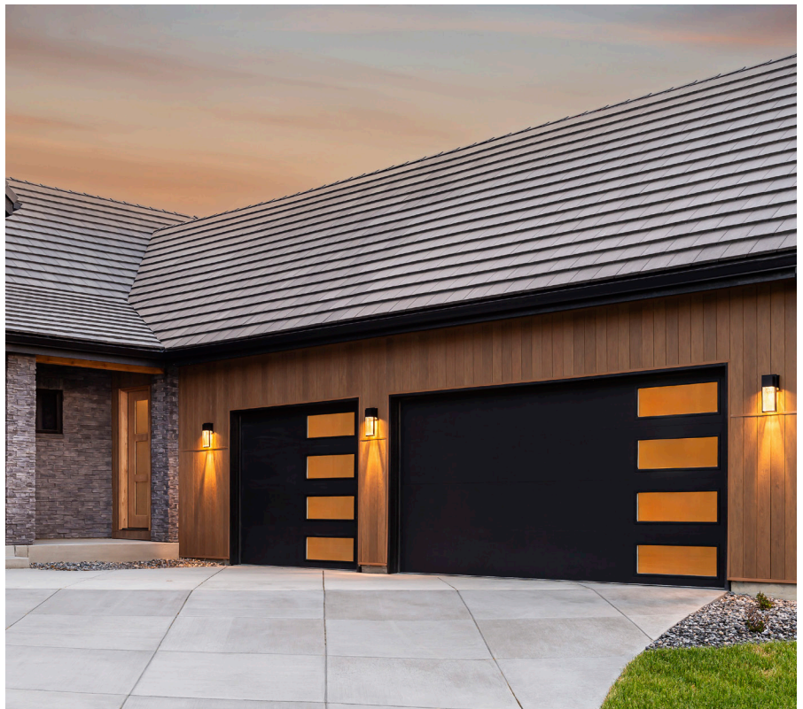
MODERN STEEL, PHOTO CREDIT: ANDY FRAME.