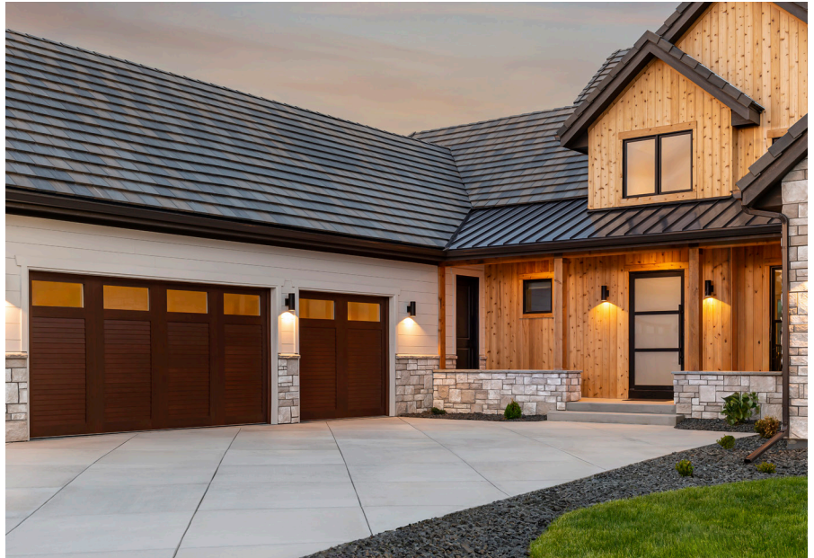
CANYON RIDGE LOUVER, PHOTO CREDIT: ANDY FRAME.