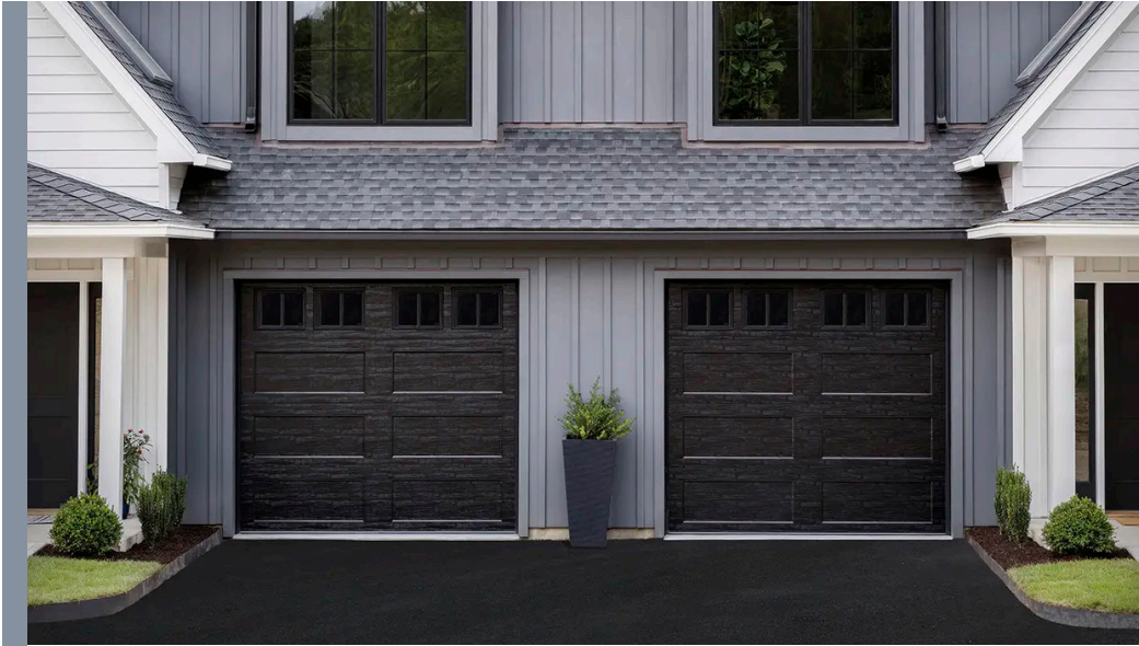
BRIDGEPORT STEEL GARAGE DOOR, LONG PANEL DESIGN WITH WINDOWS.