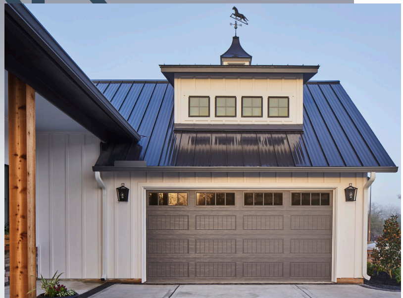
GALLERY STEEL IN CHARCOAL.