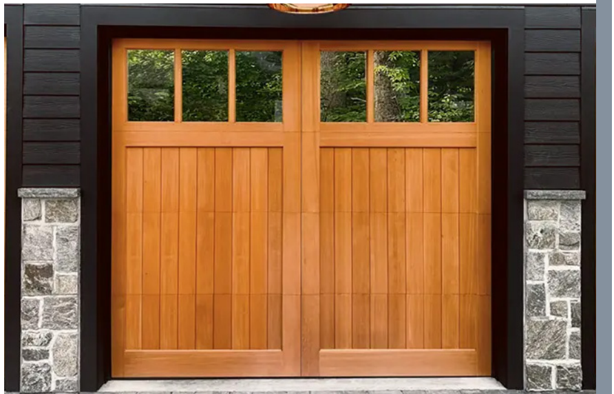
RESERVE WOOD LIMITED EDITION GARAGE DOORS IN CEDAR FINISH.

If the exterior is painted charcoal or navy, a garage door in a lighter color such as white, beige, gray or even a wood tone, is a sharp choice. These neutral tones not only contrast beautifully with dark exteriors, but also create a striking visual impact that instantly elevates the look of a home.