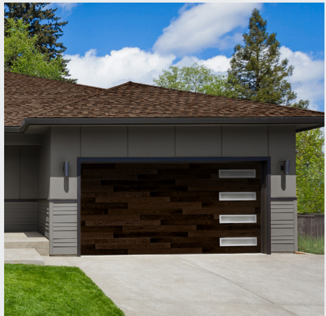
MODERN STEEL ULTRA-GRAIN PLANK IN ESPRESSO.

These shades work well with the most popular siding colors including greens, blues, gray, black, and of course, white.