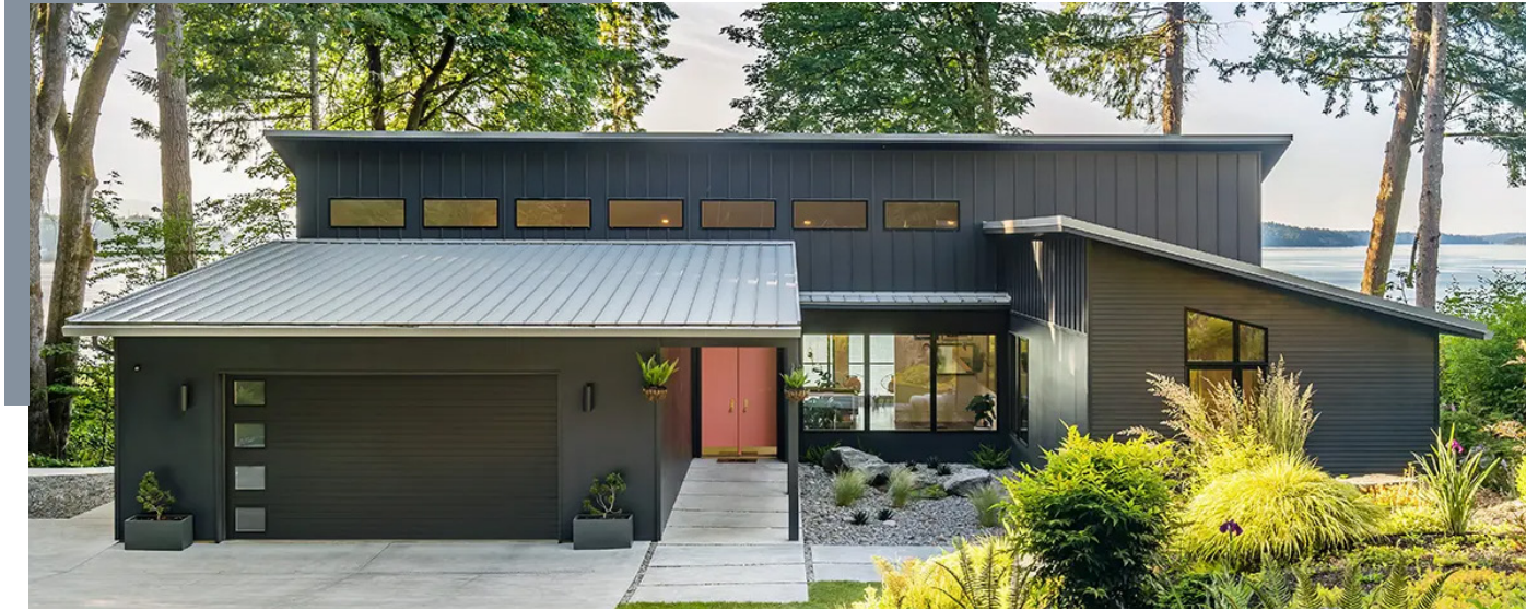
BLACK MODERN STEEL GROOVED PANEL DESIGN WITH FROSTED GLASS WINDOWS DOWN ONE SIDE.