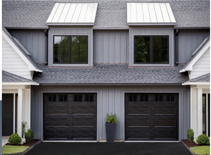
BRIDGEPORT STEEL RECESSED PANEL DOOR IN BLACK.

Dark colors like Charcoal, Dark Brown and Black are increasing in popularity to complement darker windows, entry doors and trim colors.