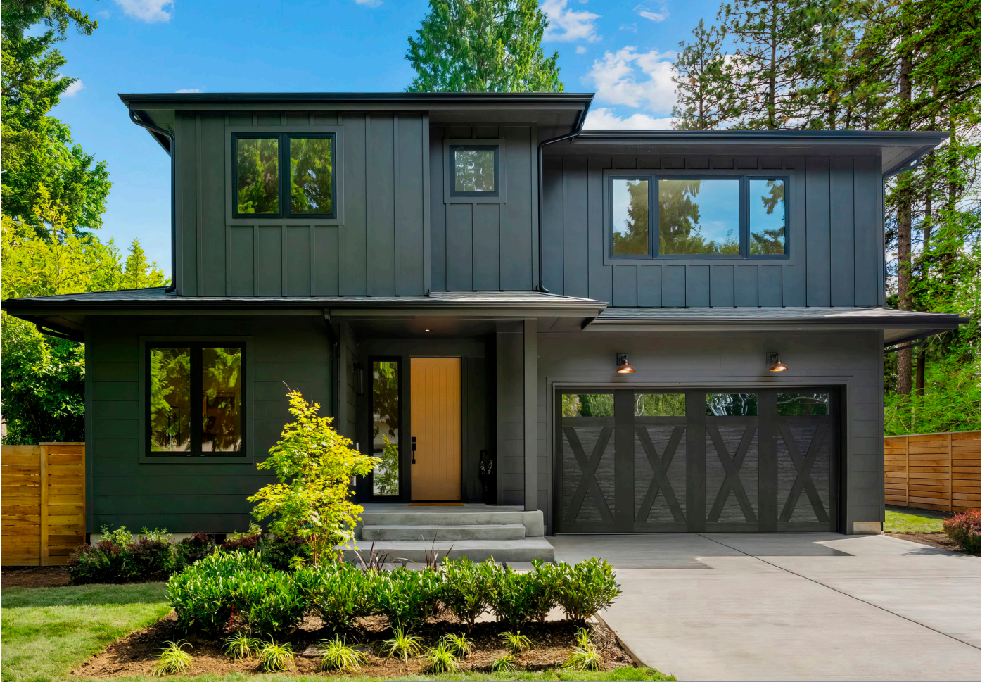
CANYON RIDGE 4-LAYER CARRIAGE HOUSE GARAGE DOOR, DESIGN IN BLACK.