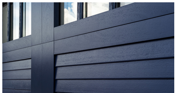
CANYON RIDGE LOUVER, PHOTO CREDIT: ANDY FRAME.