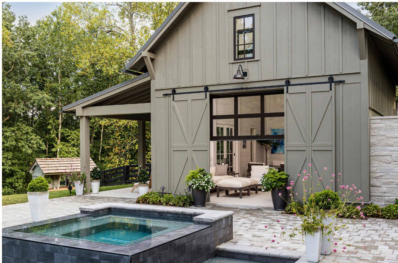
AVANTE, SOUTHERN LIVING IDEA HOUSE.

There are plenty of features to love on the 2023 Southern Living Idea House but from the comments we've seen on social media, the party barn is a hands down favorite. Designed to look like a rustic barn with an authentic cupola, it features two Avante® glass garage doors that open up to the pool and patio area.