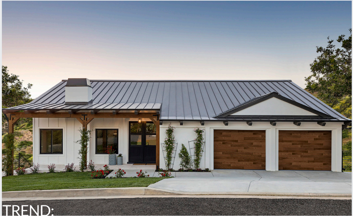
MODERN STEEL ULTRA-GRAIN PLANK IN KONA FINISH.

Wood-look finishes on low-maintenance materials like steel or composite are also popular.