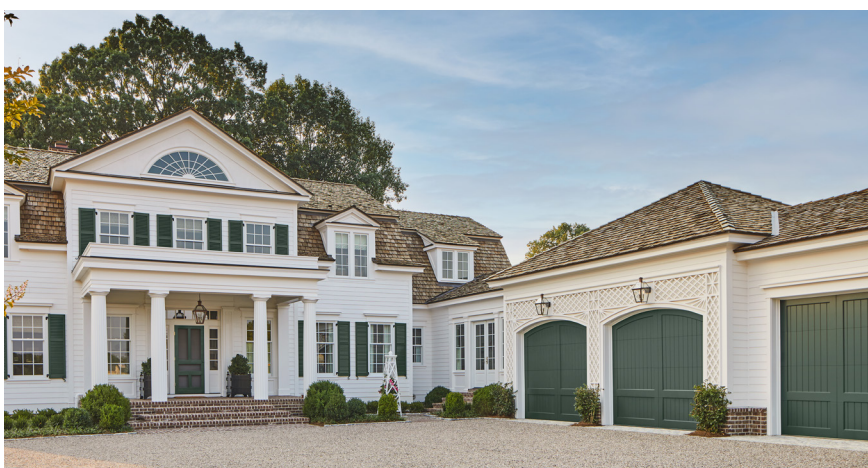
RESERVE WOOD EXTIRA WITH COLOR BLAST, SOUTHERN LIVING IDEA HOUSE, PHOTO CREDIT: LAUREY GLENN.