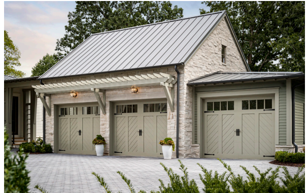
CANYON RIDGE CHEVRON, PHOTO CREDIT: ANDY FRAME.

Clopay introduced the Canyon Ridge® Chevron to mimic the popular flooring style, lending eye-catching flair to these carriage style garage doors.