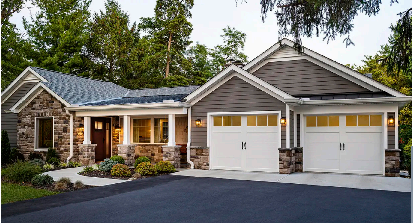
COACHMAN GARAGE DOOR, DESIGN 11 WITH REC13 WINDOWS IN WHITE.