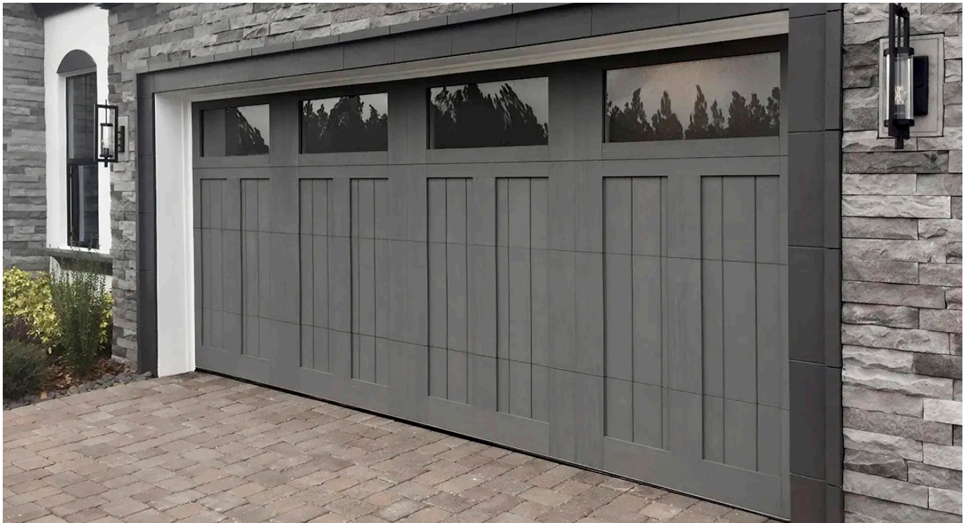
CANYON RIDGE 5-LAYER CARRIAGE HOUSE GARAGE DOOR, DESIGN 12 WITH REC11 WINDOWS IN A CUSTOM STAIN FINISH.