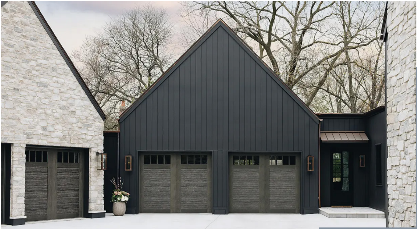
CANYON RIDGE 4-LAYER CARRIAGE HOUSE GARAGE DOORS, DESIGN 11 WITH REC14 WINDOWS IN SLATE ULTRA-GRAIN FINISH.