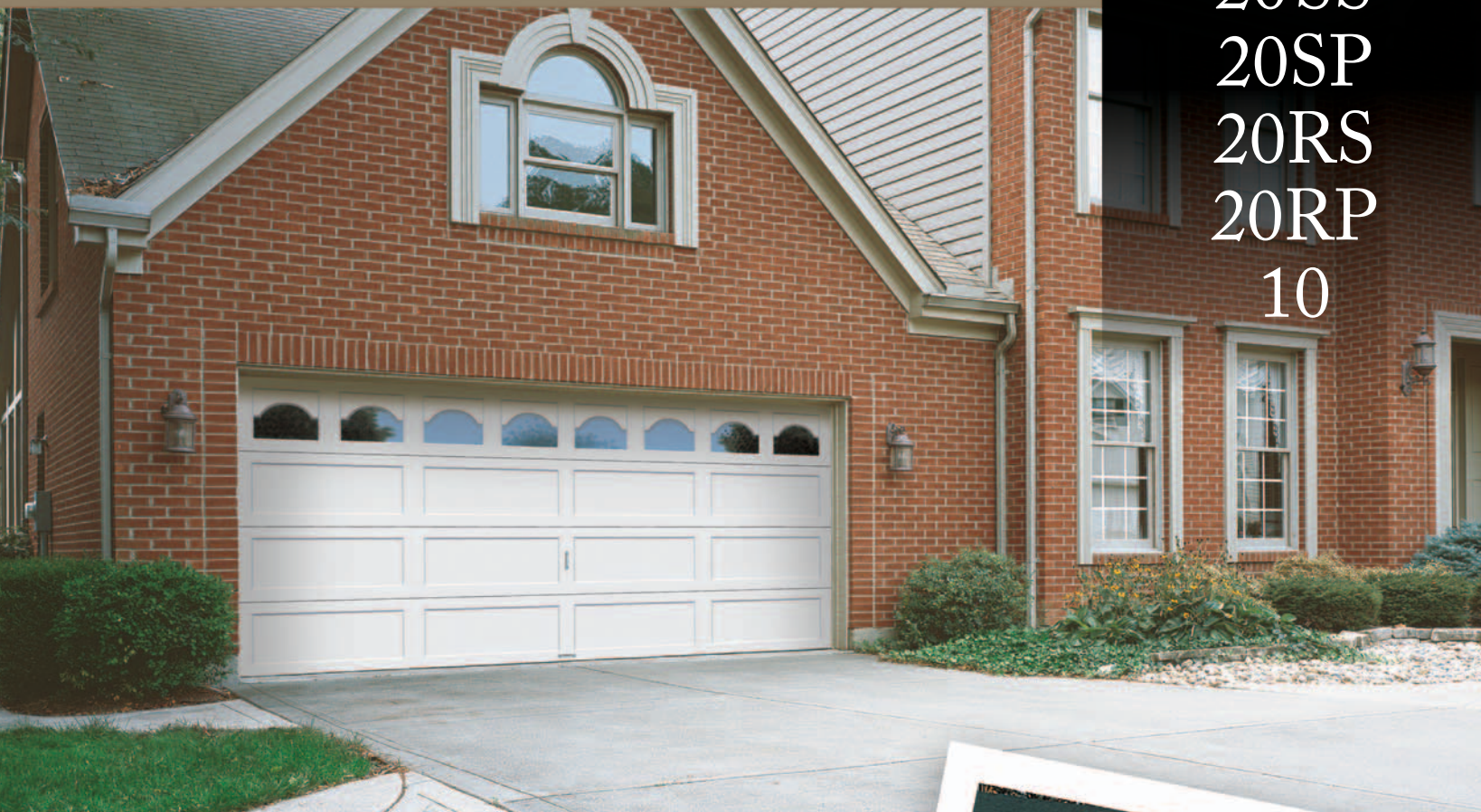
Model 20SP Long Panel Design, 4/4 Configuration with Optional Cathedral Short Window Design

Clopay's Model 20 Series and Model 10 wood garage doors provide natural beauty with strength and durability. Model 20 Series is a heavy-duty door with wider stiles and rails than the standard-duty door Model 10. These doors are available in a large variety of panel combinations and window decorative inserts. With all these options, Clopay can provide you with a door that is both attractive and economical.