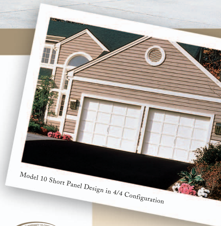
Model 10 Short Panel Design in 4/4 Configuration

Clopay's Model 20 Series and Model 10 wood garage doors provide natural beauty with strength and durability. Model 20 Series is a heavy-duty door with wider stiles and rails than the standard-duty door Model 10. These doors are available in a large variety of panel combinations and window decorative inserts. With all these options, Clopay can provide you with a door that is both attractive and economical.