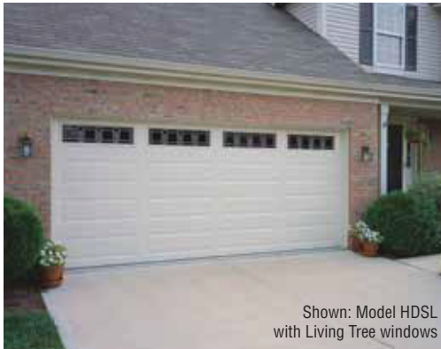
Shown: Model HDSL with Living Tree windows