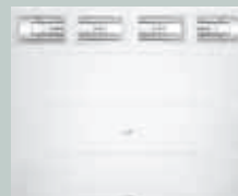
Art Deco I & II