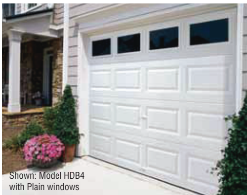
Shown: Model HDB4 with Plain windows