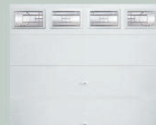
Art Deco I & II