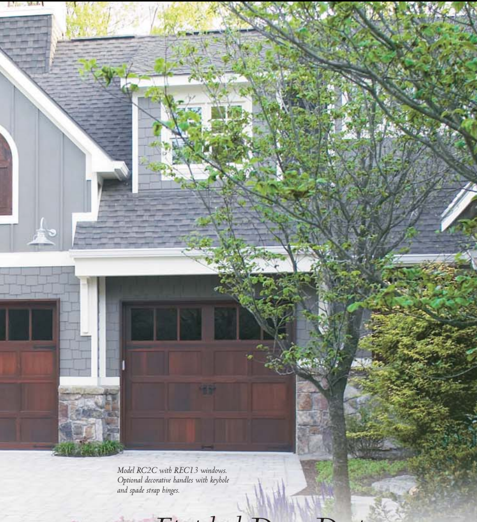
Model RC2C with REC13 windows. Optional decorative handles with keyhole and spade strap hinges.