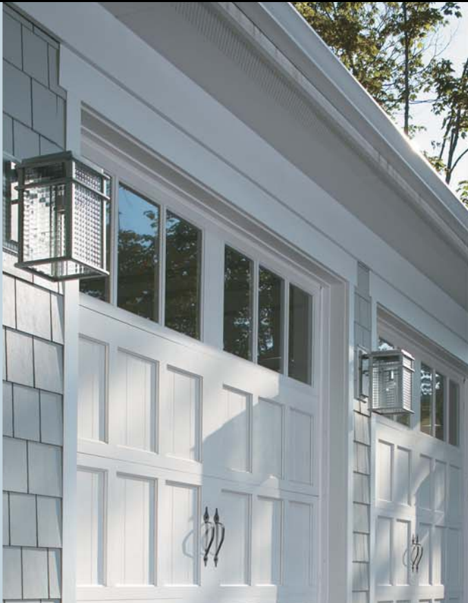
RH3G with REC13 windows. Standard spade handles. Doors have been painted by the consumer.