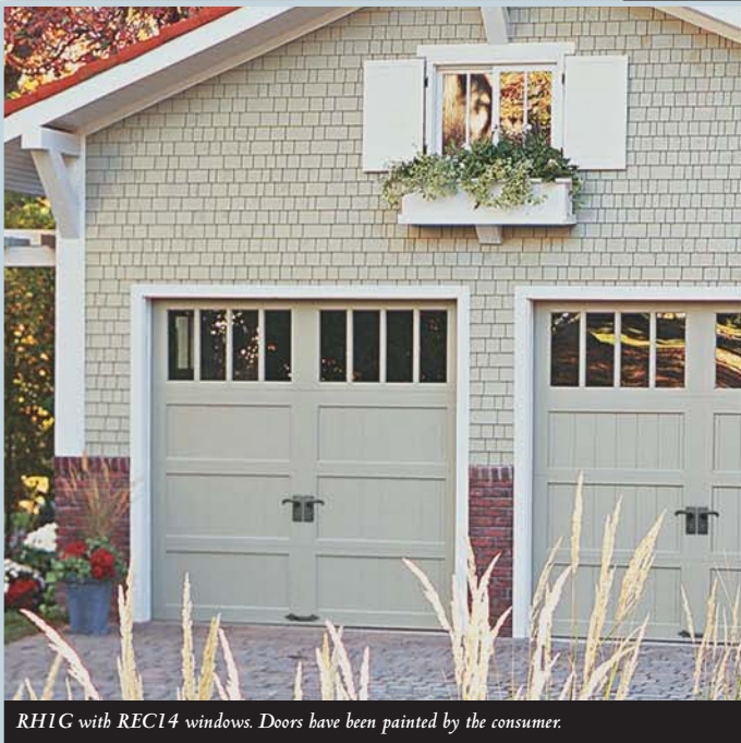
RH1G with REC14 windows. Doors have been painted by the consumer.