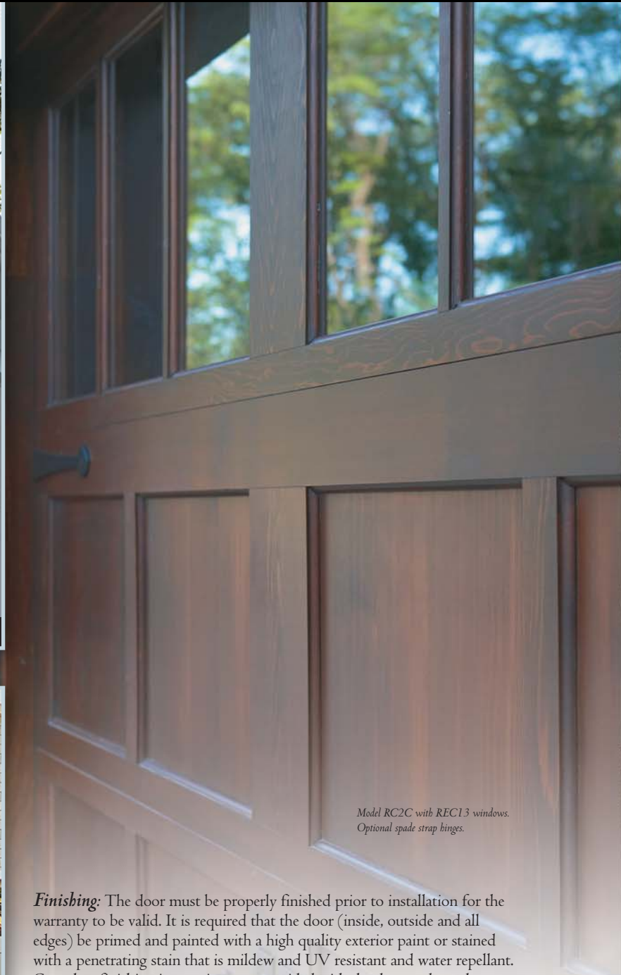
Model RC2C with REC13 windows. Optional spade strap hinges.

Finishing: The door must be properly finished prior to installation for the warranty to be valid. It is required that the door (inside, outside and all edges) be primed and painted with a high quality exterior paint or stained with a penetrating stain that is mildew and UV resistant and water repellent. Complete finishing instructions are provided with the door and are also available online at www.clopaydoor.com .