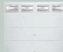
Art Deco I & II