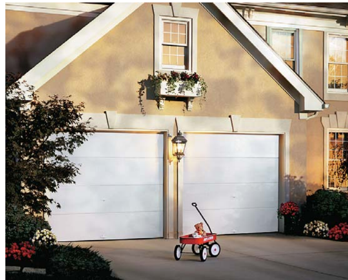
Model 4051 Flush Panel Woodgrain Design

Your garage door can account for over 40% of your home's curb appeal. Shouldn't it be as beautiful as the rest of your home?